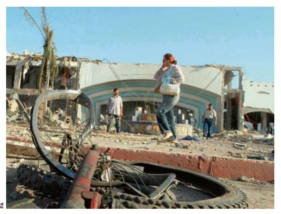
In July 2005, 88 people were killed and 150 wounded during a coordinated bomb attack on tourist sites in Sharm el-Sheikh. The attack was claimed by the Abdallah Azzam Brigades, the same group believed responsible for the October 2004 attack in Taba.

The transformation of this group began in 1980 when they adopted Muhammed Farag's "Jihad Strategy". This legitimized attacking the government and conducting terrorist operations until the regime approved sharia (Islamic law), leading the group to begin a campaign of violence that lasted into the late-1990s. JI's trajectory altered dramatically again after an infamous attack on foreign tourists at Hatshepsut temple in 1997, in which 62 people were killed. The regime, by then headed by Mubarak, initiated a crackdown and public opinion shifted dramatically and against the terrorists. In response, JI