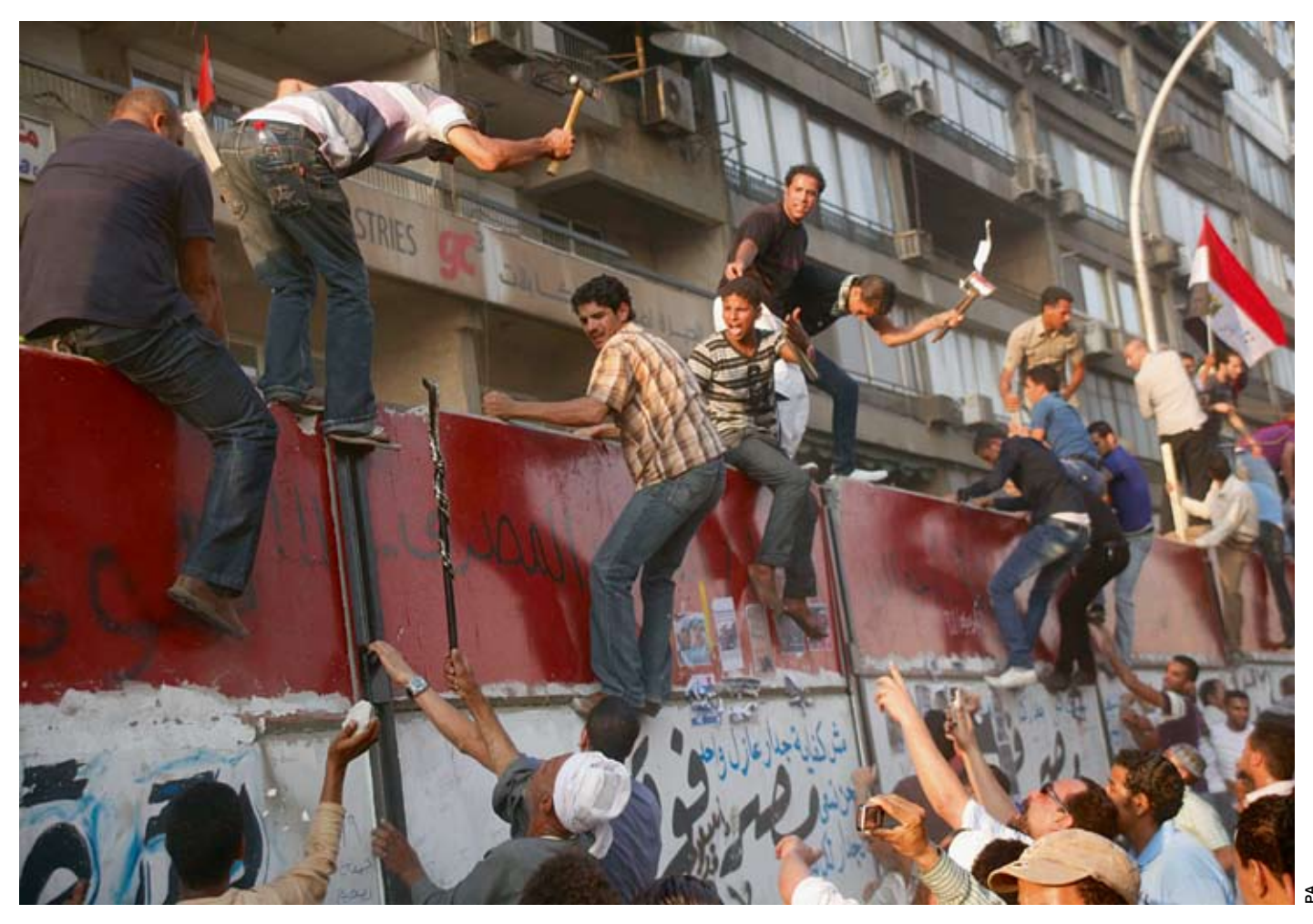
On 8 September 2011, Islamist and secularist politicians signed a petition demanding the expulsion of the Israeli ambassador to Egypt, the withdrawal of the Egyptian envoy in Tel Aviv, the barring of Israeli ships from transiting the Suez Canal, and the extradition to Egypt of the Israeli soldiers involved in the border skirmish. The following day, large protests converged on the Israeli embassy in Cairo, which culminated in the storming of the diplomatic mission.

tion, Egyptian police became a focus of popular anger and many were pulled off the streets. Today, the police have redeployed and are trying to reshape their role in a post-Mubarak Egypt, according to a June 2011 article by the Christian Science Monitor . Rebuilding public trust in the Egyptian police service may prove to be a long-term challenge.