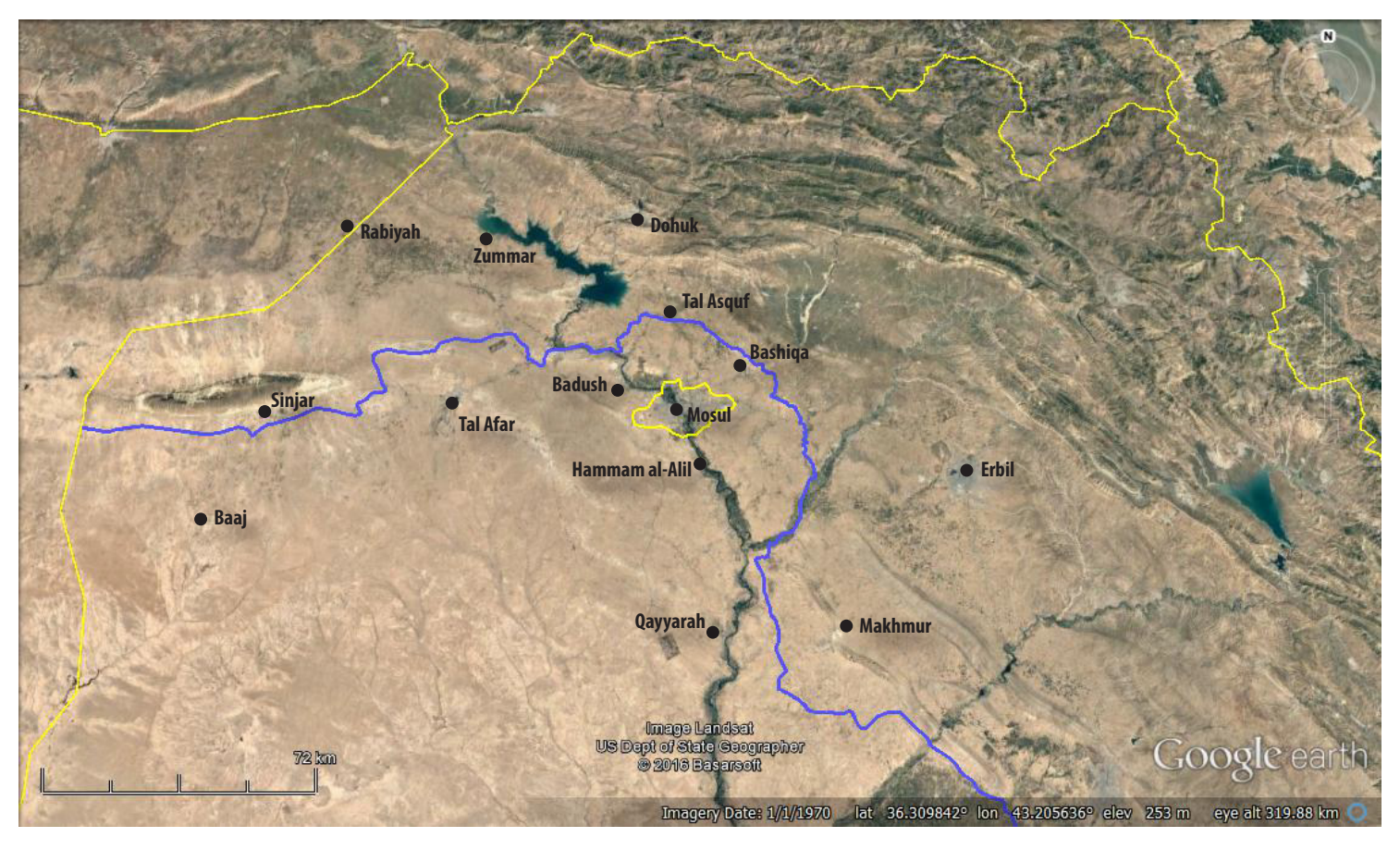
Ninawa Map Situating Mosul City