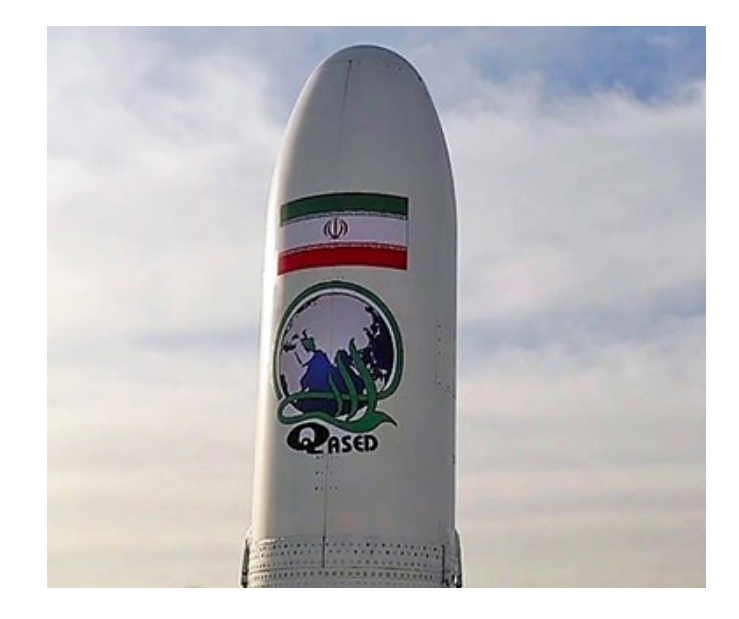
A close-up view of the Qased.