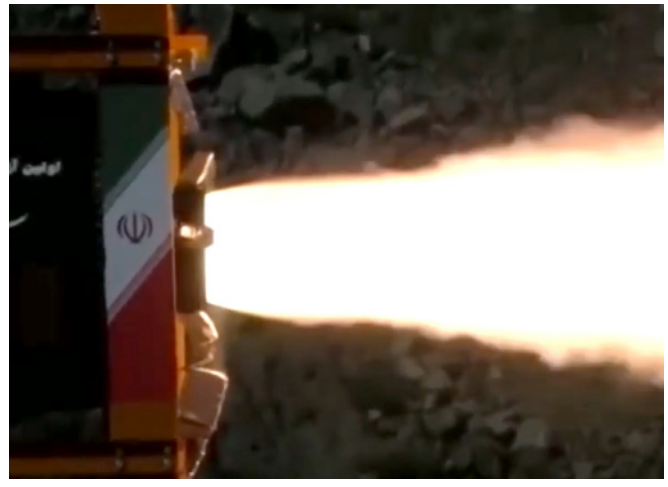
Two images of the Salman-1 rocket motor—about one meter in diameter—used for the second and possibly third stages of the Qased launch.

motors offer a high thrust-to-weight ratio. According to the IRGC, forthcoming launch configurations will consist entirely of solid motors, suggesting the use of larger-diameter booster stages—as first seen in a grainy 2010/11 video of Hassan Tehrani Moghaddam, then head of Iran's missile and SLV projects, and in tests at the Shahrud facility. Other sources have suggested a first- and second-stage Sejjil missile will instead be employed in future IRGC space launches.<sup>8</sup>