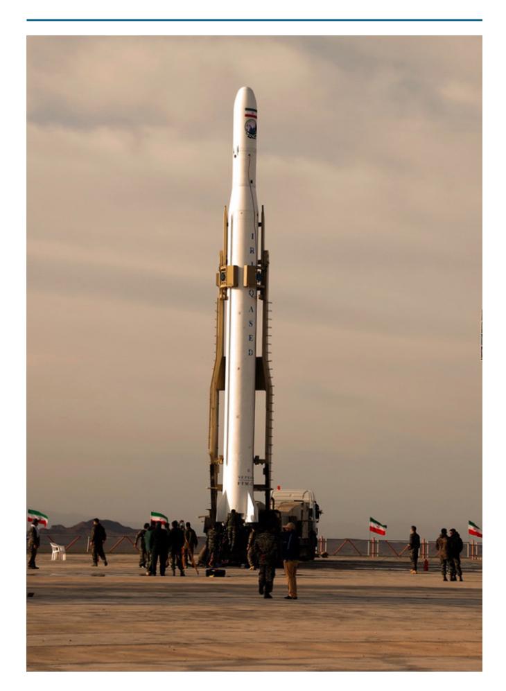
The IRGC's Qased space-launch vehicle, shown at the Shahrud site in April.

The Qased-1, for its part, succeeded over its three stages in placing the very small Nour-1 satellite in a near circular low earth orbit (LEO) of about 425 km. The first stage involved an off-the-shelf Shahab-3/ Ghadr liquid-fuel missile, although without the warhead section, produced by the Iranian Ministry of Defense.<sup>2</sup> According to ASF commander Gen. Amir Ali Hajizadeh, the IRGC chose it to cut costs and to guarantee telemetry from the second and third Qased launch stages.<sup>3</sup> The second—and possibly third—Qased stages used a new solid-propellant rocket motor, Salman-1, developed by the ASF's secretive Self-Sufficiency Jihad Organization as part of a so-called mega-project unveiled February 9, 2020, which included launch vehicles, satellites, and ground stations. This composite-casing solid motor incorporates a moving nozzle with thrust vector control (TVC) technology, replacing the less efficient moving jet vanes from the Scud generation.