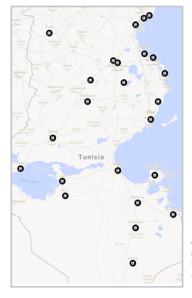
Map 4. Tunisian Foreign Fighter Mobilization to Libya, 2011–17. CLICK MAP TO VIEW FULL ONLINE VERSION.