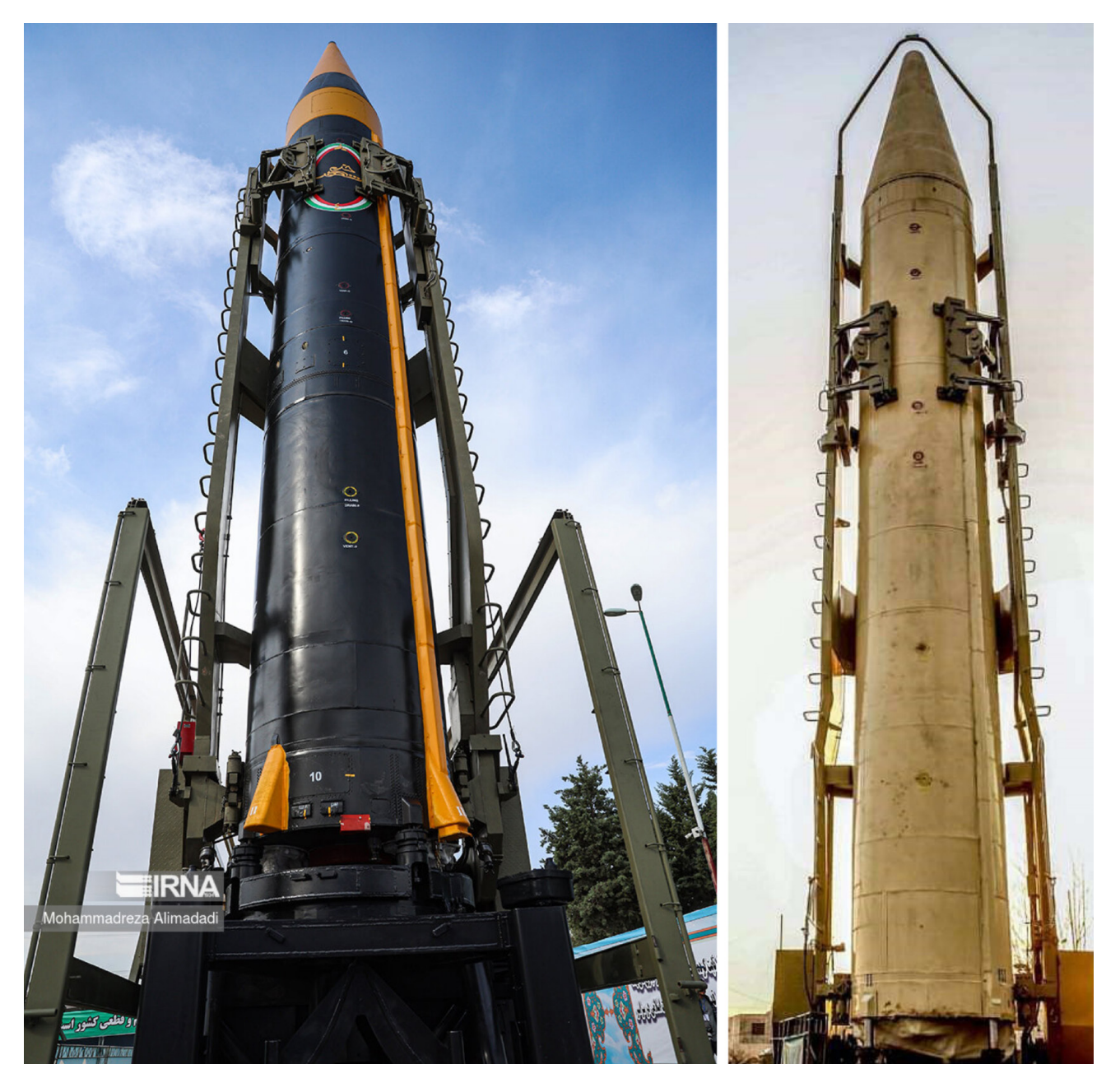
A side-by-side comparison of the Khoramshahr-1 (right) and 4 engineering prototypes shows modifications in areas like erector arms, nose cone, reentry vehicle skirt area, fuel- and oxidizer-tank configuration, missile-launchpad attachment points, and what appear to be added stabilizing fairings.

From the beginning, the Khoramshahr was clearly capable of carrying a nuclear warhead like that being designed by Iran during the early 2000s and perhaps later. According to documents from a hard drive smuggled out of Iran in 2004 by a nuclear scientist's wife and verified by the International Atomic Energy Agency (IAEA) and Western intelligence services—as well as the nuclear archive obtained by Israel during a clandestine mission in January 2018—Iran began