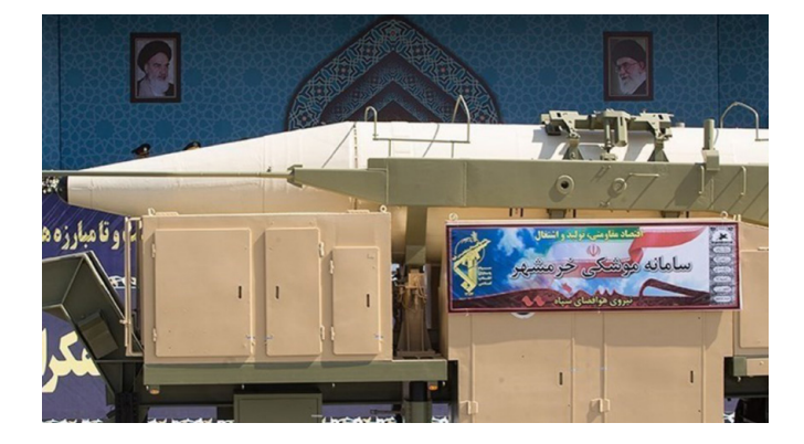
The Khoramshahr-1 debuts at a September 22, 2017, military parade in Tehran.