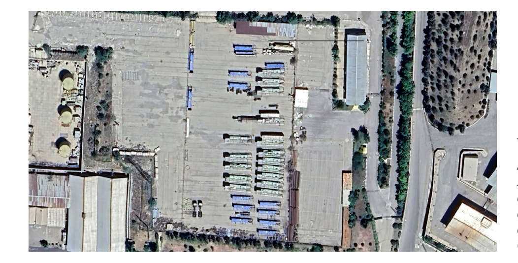
Satellite imagery of east Tehran's Hakimiyeh missile industrial complex from spring 2023 shows completed Khoramshahr TELs apparently awaiting delivery.

The question thus arises of what can be done to limit the risks of these growing Iranian capabilities alongside its perceived march toward a nuclear weapon capability. Already, the United States, several European countries, and Israel have been developing high-tech anti-hypersonic missile detectors and interceptors, but these efforts need to be given higher priority and be better integrated across national boundaries. Furthermore, Washington especially-by fielding a credible long-range conventional precisionstrike capability in the region that incorporates hypersonic speeds and maneuverability, along with optional hardened-target penetration-could help discourage an increasingly emboldened Tehran. The U.S. Army's land-mobile Long-Range Hypersonic Weapon (LRHW), a ground-launched boost-glide missile system with a range of about 2,800 km, will soon enter operational service, and while the Indo-Pacific is often considered the theater of choice for deployment of such advanced systems, the Middle East should also be considered for any early deployment. This way, the United States could reassure Iran's neighbors and demonstrate its ability to quickly strike any number of military targets throughout Iran and the region with confidence and impunity. *