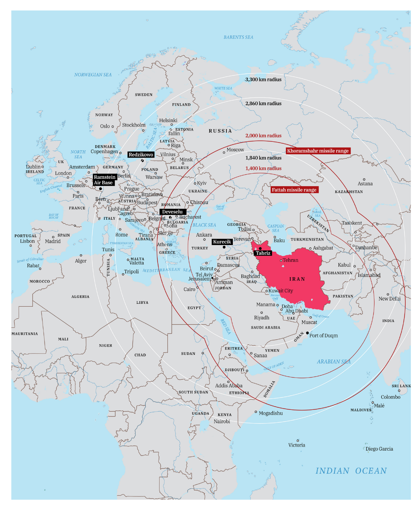
Map showing reported maximum range of Iran's Khoramshahr and Fattah ballistic missiles, and comparative distances from Europe's Aegis Ashore missile defense facilities.