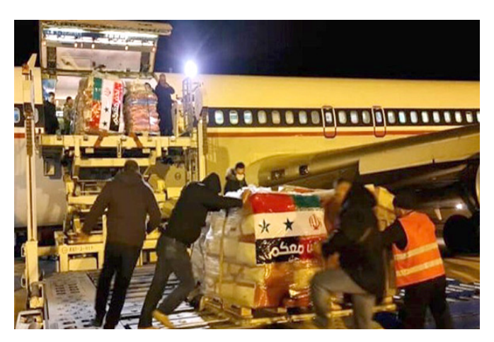
A flight carrying aid from Iran arrives at Aleppo International Airport, February 8.

Riyadh delivered three cargo planes of relief aid over February 14–16, carrying more than seventy tons of supplies to regime-controlled areas.42