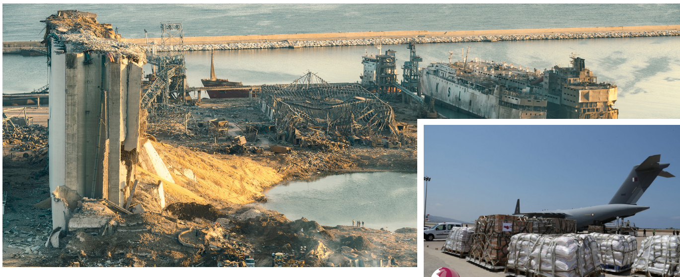
Qatar took the lead in providing relief to Lebanon after the August 2020 port explosion.