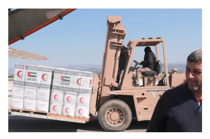
UAE Air Force delivers humanitarian aid in Syria, February 14.