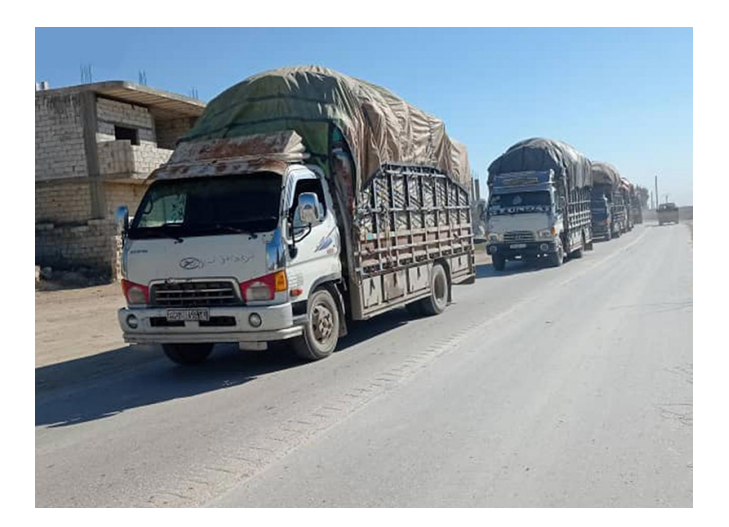
Trucks loaded with humanitarian aid enter Syrian-rebel-held areas.

Iraq's Kurdistan Regional Government sent thirteen humanitarian aid trucks to Jindires, a town in Aleppo governorate hard-hit by the earthquake.48