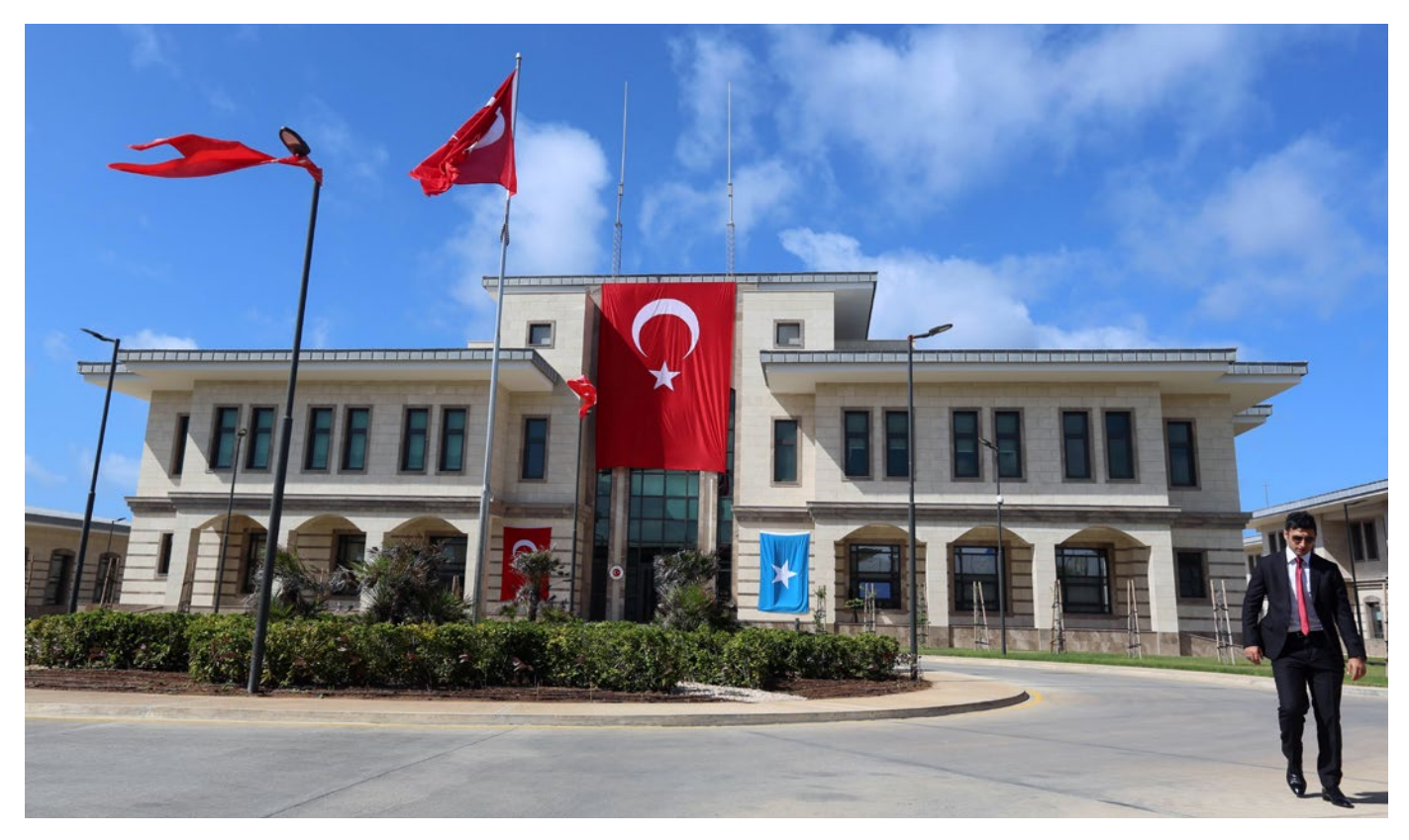
The Turkish embassy in Mogadishu.

green-lighted an extended troop deployment around the Indian Ocean, including in Somalia, until February 2023.<sup>27</sup> Ankara has also signed military cooperation and training agreements with Ethiopia, Niger, Senegal, and other countries.<sup>28</sup> In total, Turkey is said to have established thirty-seven military offices on the continent.<sup>29</sup>