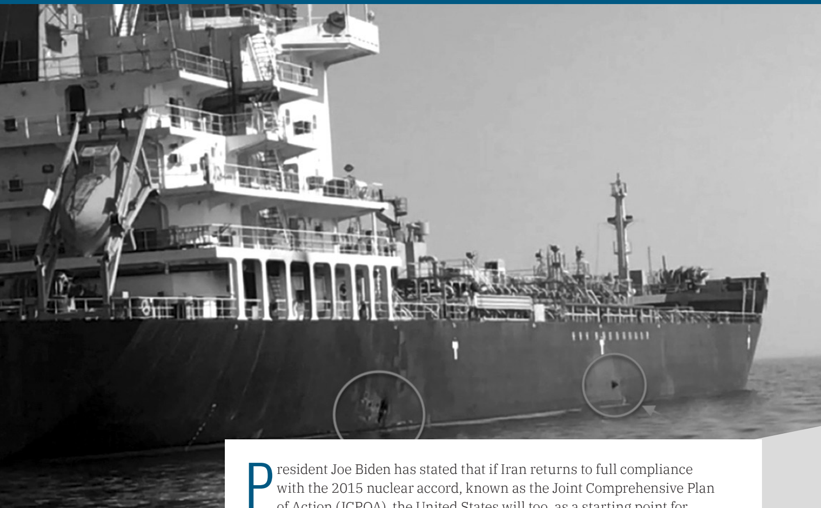
Image: The Japanese-owned tanker Kokuka Courageous, showing damage from an Iranian limpet mine attack in the Gulf of Oman, June 2019.

of Action (JCPOA), the United States will too, as a starting point for follow-on talks about Iran's missile program and regional activities. <sup>1</sup> The path to a stronger, longer, and broader JCPOA, however, may be tortuous and prolonged; success is not foreordained. Indeed, since the Biden administration took office, Tehran has already resumed proxy attacks on U.S. intrests in Iraq, and has accelerated work on its nuclear program while limiting access by international inspectors, in order to (1) build leverage, (2) roll back U.S. sanctions, and (3) obtain other concessions. Washington needs to be able to deter or counter such moves and deny Tehran advantage in ways that do not hinder renewed diplomacy. Moreover, even if talks succeed, U.S.-Iran ties will