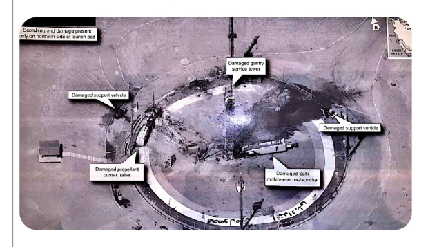
6:44 pm · 30 Aug 2019 · Twitter for iPhone

The United States of America was not involved in the catastrophic accident during final launch preparations for the Safir SLV Launch at Semnan Launch Site One in Iran. I wish Iran best wishes and good luck in determining what happened at Site One.