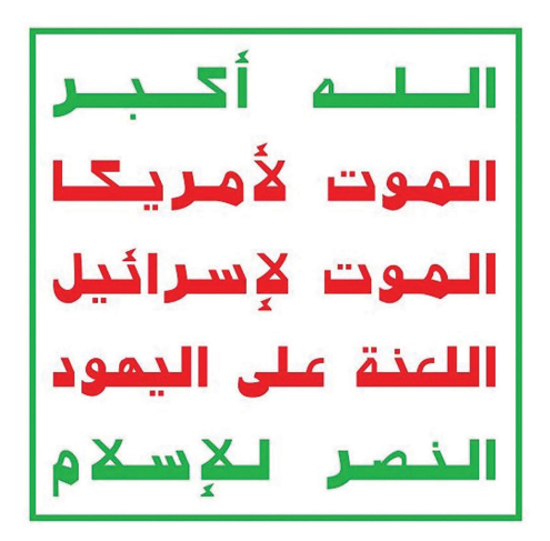
Figure 3. Houthi Slogan

In translation, the Houthi slogan reads, "Allah/God is greatest, death to America, death to Israel, curse the Jews, victory to Islam."