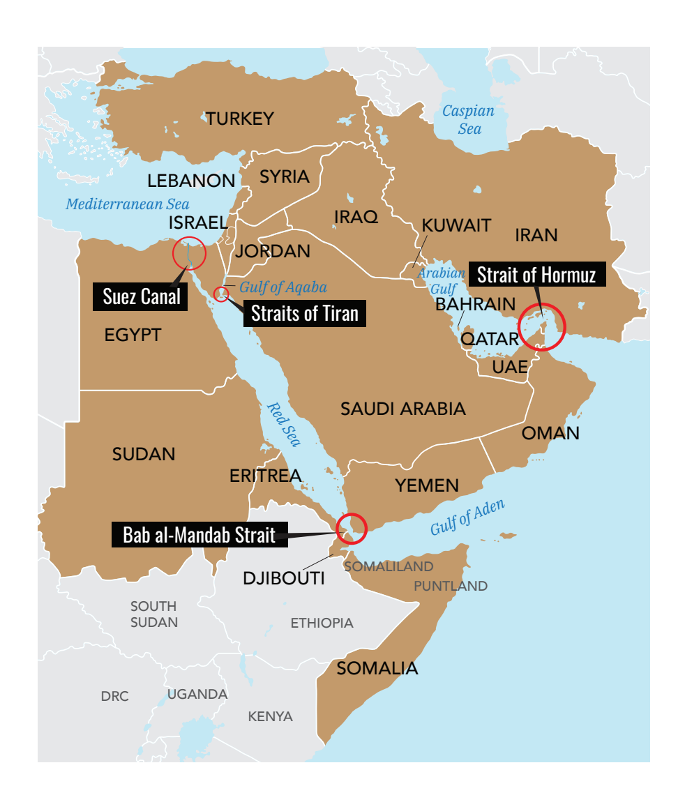
Figure 4. Bab al-Mandab Strait and Arabian Gulf