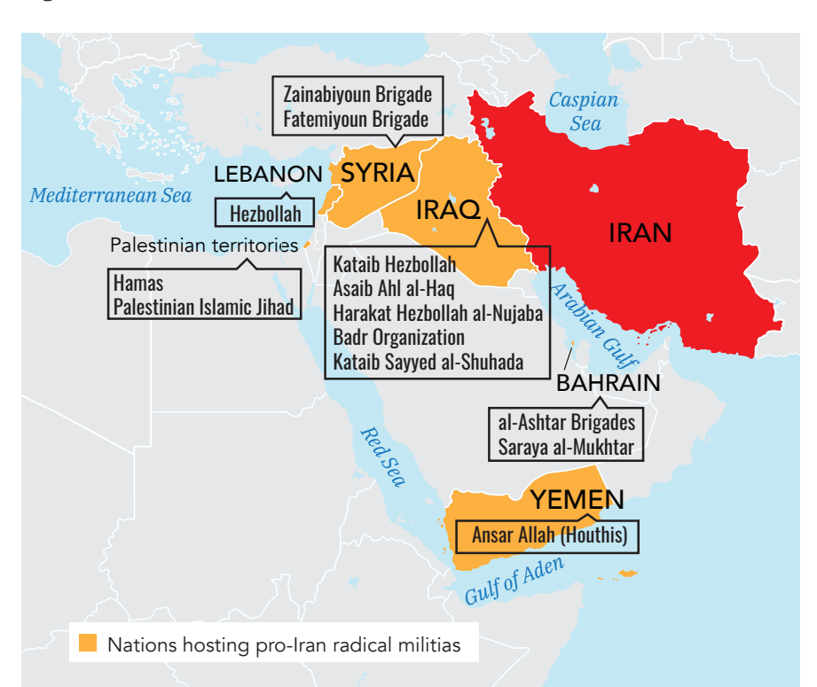
Figure 1. Iran and Its Proxies

Beirut, Damascus, Baghdad, and Sanaa. In all these places, it has exploited civil wars and interstate conflicts to deepen its political, economic, and military influence.