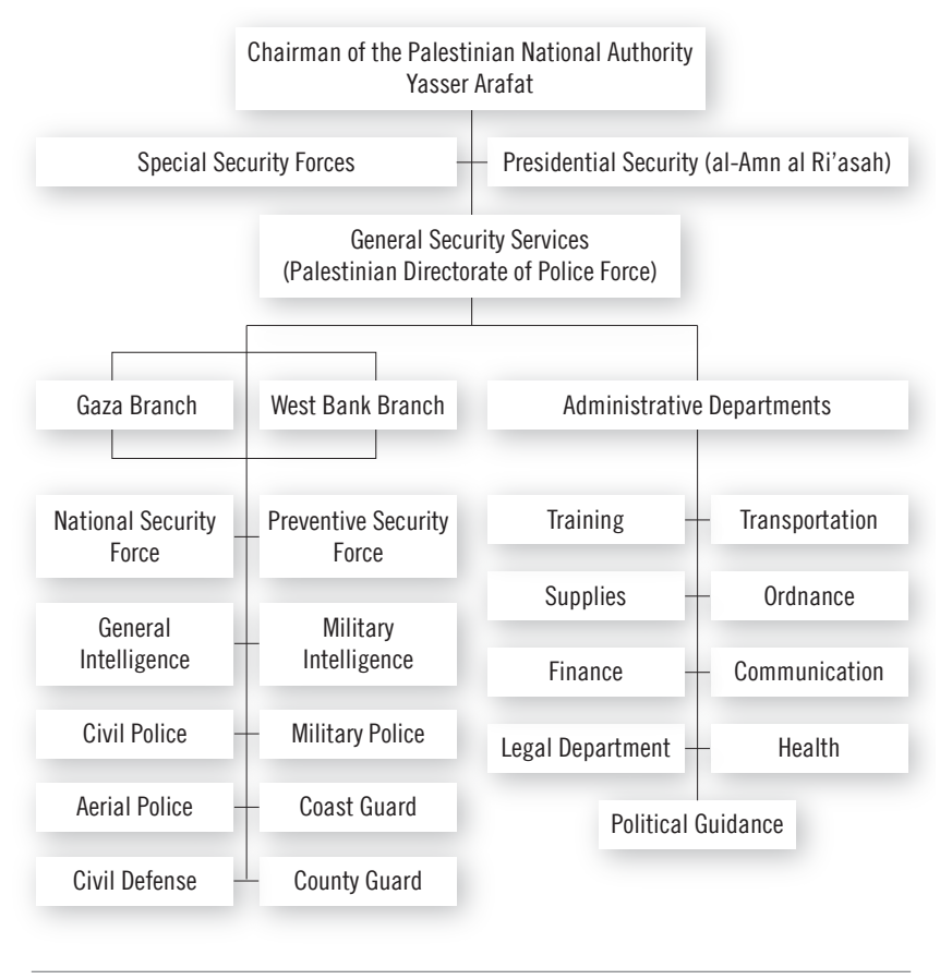
FIGURE 1 Formal structure of the Palestinian Security Services.

held by Preventive Security. Military Intelligence's subordinate unit, Military Police, was also tasked with enforcing discipline among the other security branches, safeguarding PA installations and officials (similar to the Presidential Guard), as well as handling riot control and arrests (similar to the National Security Force and Civil Police). The Provincial Guard, a small force assigned to district governors' offices, summoned people for arrest and mediated local disputes, a task that by definition blurred into the jurisdictions of the other security branches operating in a given region. Most indicative of all was the Special Security Force, which was created in 1995 and operated under Arafat's direct control. According to Luft, the official mission of this service was to gather intelligence on opposition groups in for-