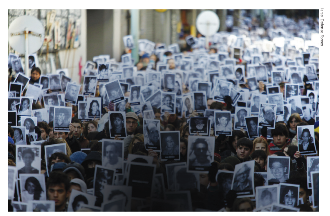
Families of AMIA victims commemorate an anniversary of the 1994 bombing that killed 85 people and injured over 300.

While Rabbani attended to the necessary logistical details in Buenos Aires, Hezbollah operatives in the tri-border area planned the the details of the operation. These two groups stayed in close touch as the plot slowly came together. Based on a joint investigation with its Argentinian counterpart, an FBI task force noted that "in the months prior to the attack, there were many calls from the mosque in the city of Iguaçu Falls to Iran, the Embassy of Iran in Buenos Aires, the Embassy of Iran in Brasilia, the at-Tauhid mosque in Buenos Aires, and the office of the cultural attaché