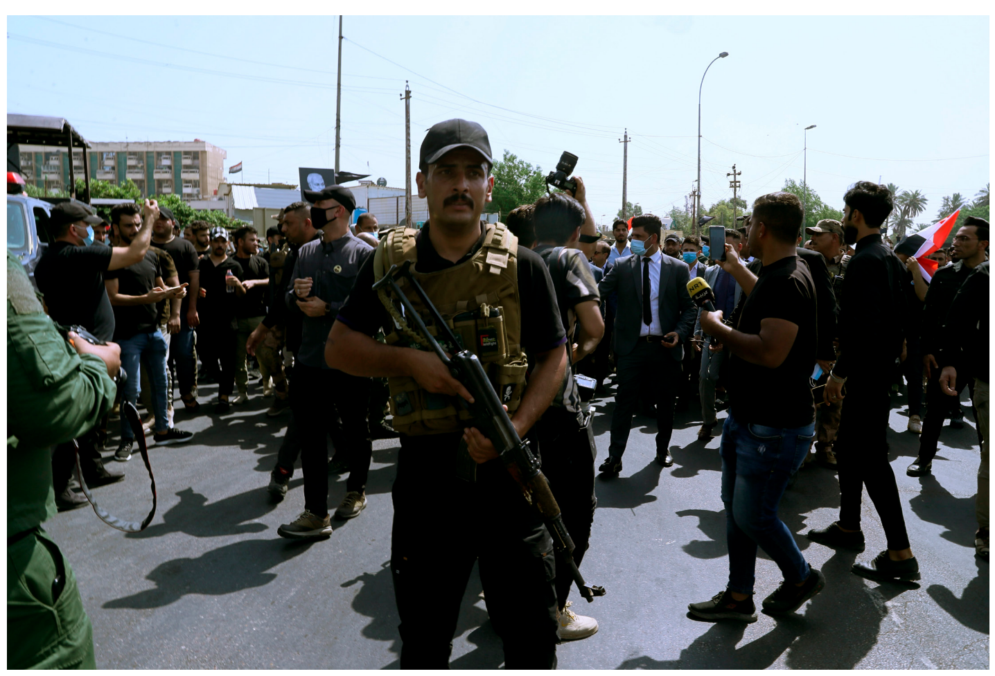
Iran-backed militia fighters march in central Baghdad, Iraq, on June 29, 2021.

United States, and then again intensified hduring the Iraqi protests that began the slow collapse of the Abdalmahdi government in November 2019 and sparked protests in Iran itself.