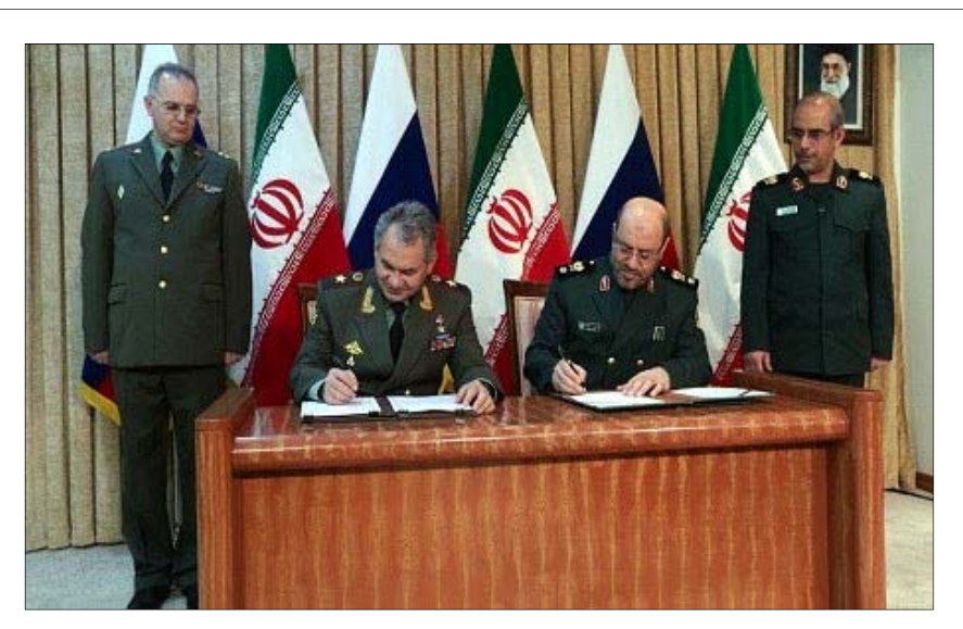
Russia's defense minister Sergei Shoigu (seated, left) and Iranian counterpart Hossein Dehghan sign an agreement to expand military ties, Tehran, January 2015. Not since World War II, has Tehran permitted a foreign country to base itself in Iran, but in August 2016, it allowed Moscow to use its Hamedan base.

deterring Washington in the Middle East. His military moves, from Georgia to Ukraine to Syria,<sup>36</sup> show he aims to reestablish a Russian presence across the Black Sea and the Mediterranean by creating and extending buffer zones along Russia's periphery (anti-access area denial bubbles, A2AD). Bv definition, these moves are an attempt to reduce Western ability to operate. "Putin is establishing long-term military а presence in the Mediterranean Sea in part to the United contest States' ability to operate