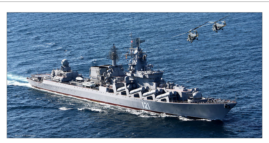
To preempt a U.S. response following a chemical attack in Ghouta by the Assad regime, Putin sent a Moskva missile cruiser, a Baltic Fleet destroyer, and a Black Sea Fleet frigate into the eastern Mediterranean.

intervention, but doubts remained about his undisclosed stockpiles. Smaller-scale chemical weapons attacks continued, and a September 2017 U.N. war crimes investigation found that Assad had used chemical weapons more than two dozen times in the last six years.<sup>31</sup>