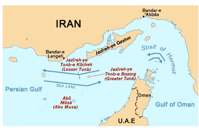
Map 2: UAE-Iran Dispute over Three Islands

In light of DPRK's menace in East Asia, Israel and Gulf allies are watching U.S. reaction to an ally under attack, as they face their own Iran menace in West Asia. Emile El-Hokayem, political editor of The National (UAE) and senior fellow at the International Institute for Strategic Studies (IISS), stated at a July 2010 Wilson Center conference that Gulf states have their own Taiwan issue. UAE has disputes over three islands with Iran (see Map 2), and Hokayem said Gulf States look at Taiwan as a litmus test for U.S. security guarantee.<sup>32</sup> He observed that Gulf States saw that DPRK sank the Cheonan and U.S. did nothing. If Gulf States get in a situation where Iran sinks a vessel, what will U.S. do to protect its allies? Hokayem said that how U.S. treats its East Asian allies is relevant for Gulf States.