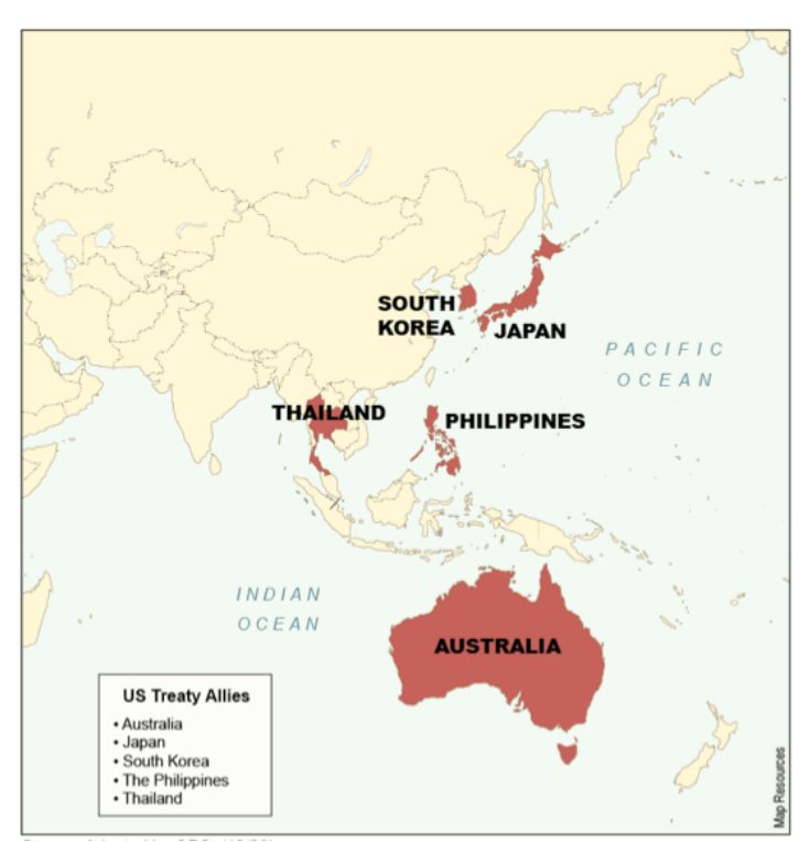
Map 4: U.S. Treaty Allies in Asia Pacific