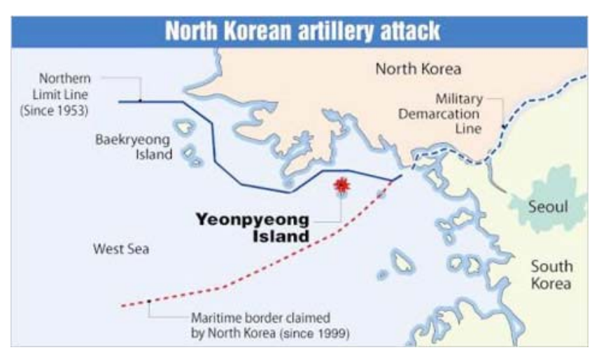
Map 1: Disputed Maritime Border between Two Koreas