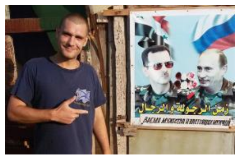
ARTICLES & TESTIMONY