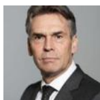
Dick Schoof (/experts/dick-schoof)

Dick Schoof is national coordinator for security and counterterrorism for the Netherlands.