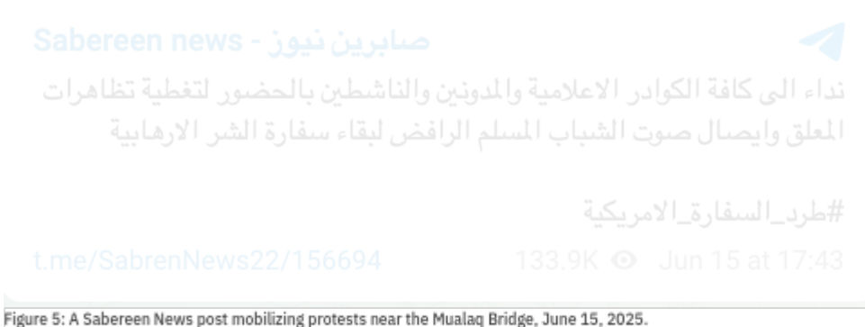
Figure 5: A Sabereen News post mobilizing protests near the Mualaq Bridge, June 15, 2025.

The muqawama are showing cohesion as well as restraint. There is no evidence yet of Iran-backed militias in Iraq striking U.S. forces or using Iraqi territory to attack Israel. Iranian drones have been intercepted in Iraq during the conflict, but they were moving through Iraqi airspace en route to Israel and reportedly passed too close to