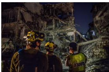
ARTICLES & TESTIMONY