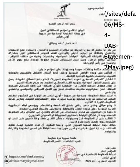
Figure 4: Closing statement of UAB's first conference, May 7, 2025.

UAB's first conference, May 7, 2025. The closing statement of the conference emphasized seven points (Figure 4): • Reaffirmation of Syria's territorial unity. • Formation of the "Unified Military Council." • Launch of the first phase of "organized revolutionary escalation." • Recognition of the "Islamic Resistance Front in Syria-Uli al-Baas" as the cornerstone of the new resistance project. • Adoption of a unifying national charter. • A call to all "patriots" inside and outside Syria to join the united "resistance" movement.