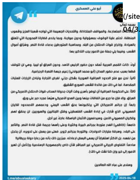
Figure 3: Abu Ali al-Askari statement on Sharaa's invitation to Iraq, April 18, 2025