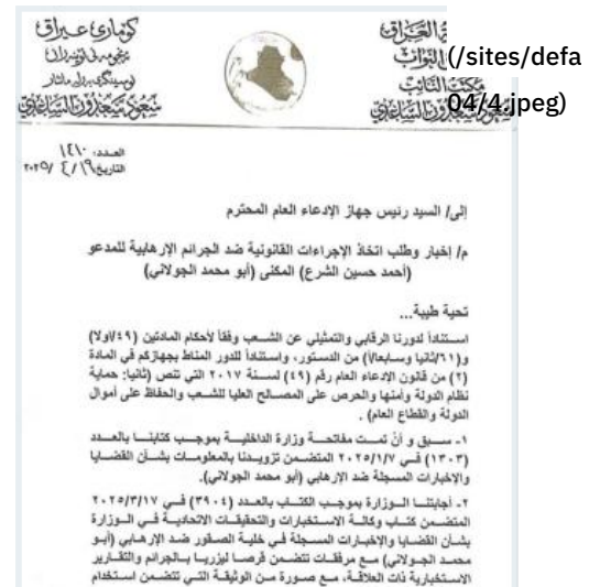
Figure 4: Saud al-Saadi's letter to the attorney-general, April 19, 2025.

AAH seems to have an additional incentive to aggressively lead this campaign—namely, it now considers Sudani an important electoral rival. In its view, the prime minister and one of his top allies—Faleh al-Fayyad, chairman of the Popular Mobilization Forces—are engaged in a head-to-head contest ( https://www.washingtoninstitute.org/policy-analysis/iraqs-pmf-law-no-substitute-real-security-reform ) with AAH for future control over the PMF. ❖