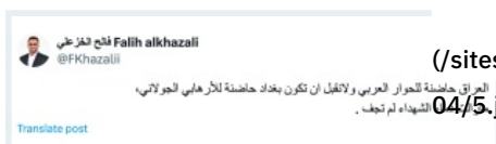
Figure 5: Falih al-Khazali's tweet on Sharaa's invitation to Iraq, April 16, 2025.

Kataib Sayyid al-Shuhada (/node/16731) also joined the chorus of groups criticizing the invitation. Falih al-Khazali, a member of parliament affiliated with the militia, voiced his opposition on social media, tweeting: "Iraq is a hub for Arab dialogue, [but] we do not accept that Baghdad should be a hub for the terrorist al-Jolani. The blood of martyrs has not dried yet" (Figure 5).