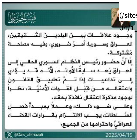
Figure 1: Khazali's statement on Sharaa's invitation to Iraq, April 19, 2025.

attempt to prevent Sharaa's arrest upon entry to Iraq will not be tolerated.