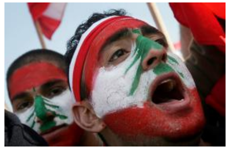
ARTICLES & TESTIMONY