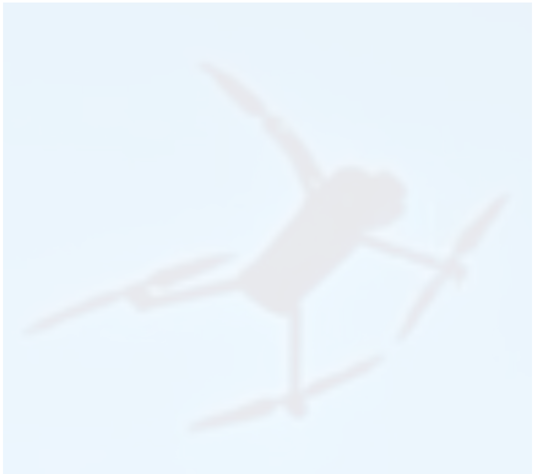
Figure 2: Quadcopter recorded by launch crew as it hovered above the scene taking video of the drone launch from above.

https://www.washingtoninstitute.org/policy-analysis/profile-islamic-resistance-iraq (IRI) has become very stale of late, SAD has shown its launch groups using a variety of methods and attired in different uniform patterns, sometimes including body armor and tactical helmets. The November 19 claim is the thirteenth the group has issued this month, eight of them on November 4 alone (which may have been a set of four claims duplicated by accident or intentionally).