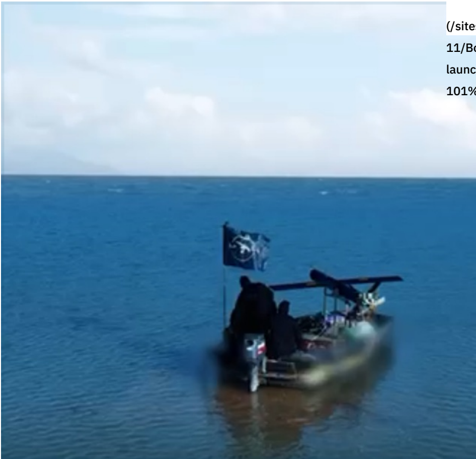
Figure 1: Drone launch from boat, November 19, 2024.

tried to provide the most interesting and diverse video footage of Iraqi militia launches. While the video format used by the Islamic Resistance in Iraq