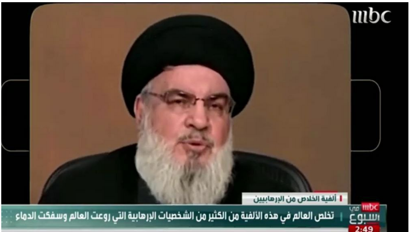
Figure 1: MBC lauds the deaths of Iran-backed terrorists, October 19, 2024.

A s part of the October 19 episode of its program In A Week, the Saudi state-funded satellite television channel MBC broadcast a segment with the title “Millennium of Salvation from Terrorists,” showing Iran-backed militants who have been killed by Israel and the United States. Amid imagery of Lebanese Hezbollah leader Hassan Nasrallah, Hamas leaders Ismail Haniyeh and Yahya al-Sinwar, Iraqi militia leader Abu Mahdi al-Muhandis, and others, the program stated, “The world has rid itself in this millennium of many terrorist figures who terrorized the world and shed blood” (Figure 1).