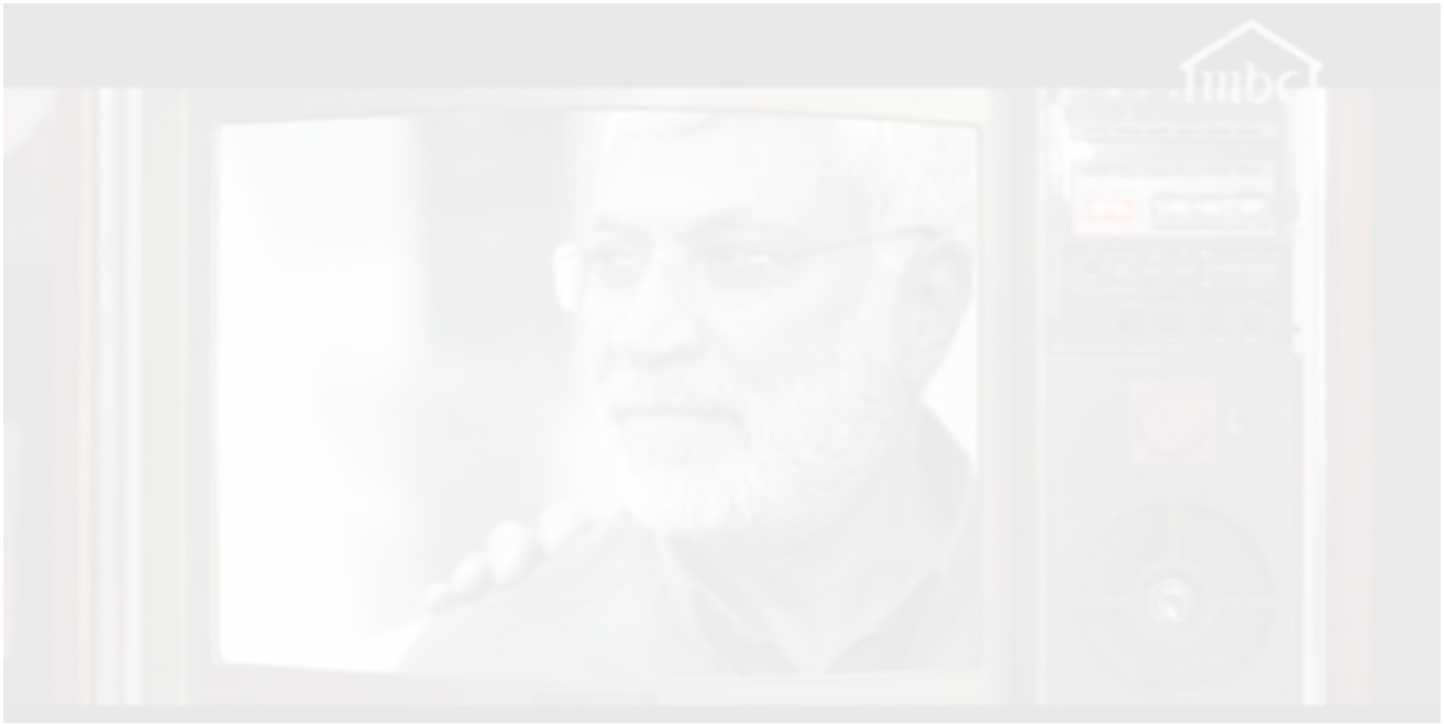
Figure 4: Abu Mahdi al-Muhandis on MBC as the mastermind of the attack on the Iraqi embassy in Lebanon in 1981.

Although the program was aired by MBC's main channel, Sanad linked it to the MBC Iraq channel, which was launched in 2019 with a focus on influencing the Iraqi public with programs that could compete with local channels. Since its launch, MBC Iraq has faced significant challenges, with the muqawama repeatedly targeting the channel for allegedly portraying Iraq's southern Shia population as less educated.