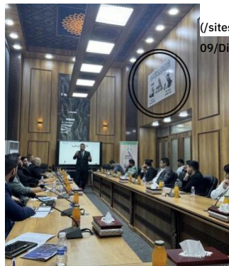
Figure 3: UNAMI meeting with Soleimani and Muhandis pictures overhead, September 2024.