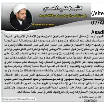
Figure 3. Ali al-Asadi statement in defense of Zaidan, June 29, 2024.