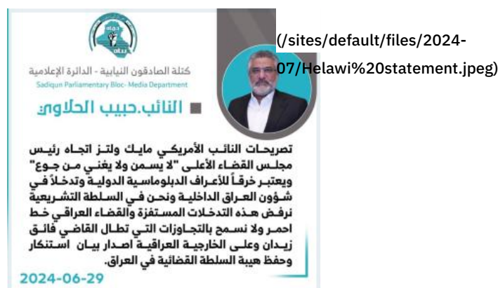
Figure 4. Habib al-Helawi statement in defense of Zaidan, June 29, 2024.

the head of the Supreme Judicial Council...are ineffective and meaningless and are considered a breach of international diplomatic norms and an interference in Iraq's internal affairs. We, in the legislative authority, reject these provocative interventions. The Iraqi judiciary is a red line, and we will not allow transgressions against Judge Faeq Zaidan. The Iraqi Ministry of Foreign Affairs must issue a statement condemning and protecting the judicial authority in Iraq" (Figure 4).