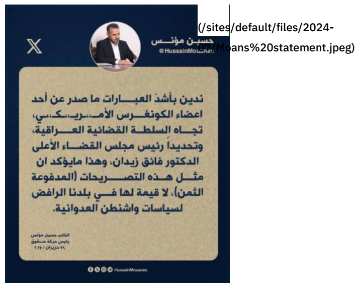
Figure 2. Hossein Moanes statement in defense of Zaidan, June 29, 2024.