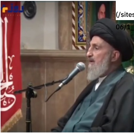
Figure 1: Screenshot of Hamid al-Husseini's speech circulating in Iranian regime social media circles since June 14, 2024.

to the end [i.e., fulfill my request]. He knows all the methods [to support the IRGC-QF] and is interested in big projects; he doesn't go after small things." The IRGC-affiliated Mashreq News posted another clip from a different angle showing the second part of these remarks promoting Qalibaf (Figure 2).