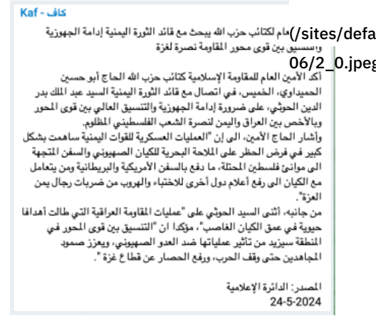
Figure 2: KH statement about Abu Hussein calling al-Houthi, May 24, 2024.

A second claim of joint attacks was made on June 12. This time, the IRI noted a missile strike against “a vital target in Ashdod” and a drone attack against “an important target in the port of Haifa” (Figure 4).