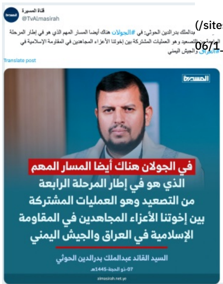
Figure 1: The Houthis' Al Masirah TV quoting the movement's leader talking about collaboration with the IRI, June 13, 2024.

operation with the Houthis seems to be part of this wider trend—