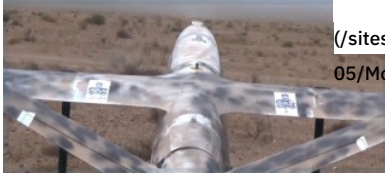
Figure 2: Mottled camouflage on the Sammad/KAS-04 V-tail drone shown in the May 2 claim, reminiscent of World War II-era "shark" skin techniques.

%D9%85%D8%AD%D8%A7%D9%83%D9%85%D8%A9-%D8%A7%D9%84%D8%A5%D8%B1%D9%87%D8%A7%D8%A8) in July 2019.