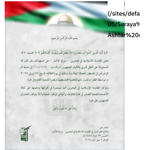
Figure 1: SAA claims to have attacked Israel, May 2, 2024.