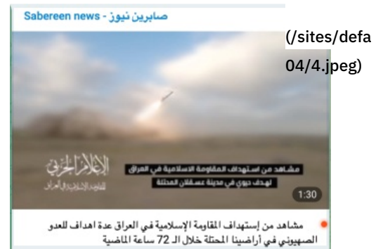
Figure 4: Sabereen News reposts IRI's video of al-Arqab attacks, April 9, 2024.

As for Sabereen News (/node/16673) , the prominent militia outlet had previously stopped posting IRI claims, angering (/node/18612) the "Jihad Brothers Team" and other social media accounts affiliated with the militia Harakat Hezbollah al-Nujaba (/node/16716) . Yet Sabereen has now resumed its coverage of IRI attacks, reposting videos of the new al-Arqab launches (Figure 4).