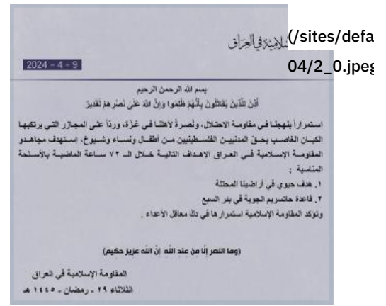
Figure 2: IRI's second statement, April 9, 2024.

3). (According to the U.S. Defense Intelligence Agency (/sites/default/files/2024-04/11.jpeg)