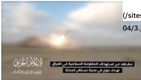
Figure 3: IRI video showing al-Arqab launches, April 9, 2024.

( https://www.dia.mil/Portals/110/Documents/News/Military Power Publications/Iran Houthi Final.pdf ), al-Arqabs are 351/Paveh-type cruise missiles that the Iran-backed Houthis in Yemen call the Quds.)