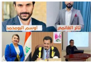
Profile: Iraqi Media Network (/policy-analysis/profile-iraqi-media-network)