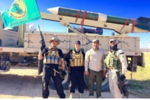
Profile: Kataib al-Imam Ali (/policy-analysis/profile-kataib-al-imam-ali)