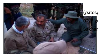
Figure 3: Dulaymi and Soleimani in Jurf al-Sakhar in 2014.

After the U.S. departure from Iraq in 2011, he returned home and built AAH's first political party, al-Sadiqoun, scoring its first electoral victory in the 2014 parliamentary election. Immediately after the win, he joined the new Popular Mobilization Forces (PMF) and took part in their first battlefield victory: an operation to retake the Jurf al-Sakhar area, where he was prominently photographed with IRGC-QF commander Qasem Soleimani (Figure 3). Since then, Dulaymi has campaigned on a platform of