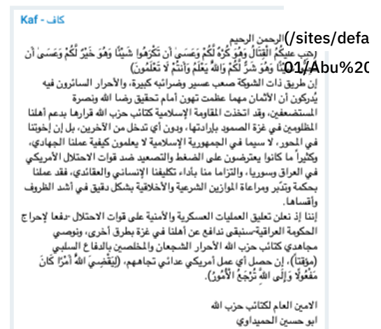
Figure 1: Abu Hussein calls for a suspension of military operations against U.S. and coalition forces in Iraq, January 30, 2024.

Hereby we announce the suspension of military and security operations against the occupation forces in order to prevent