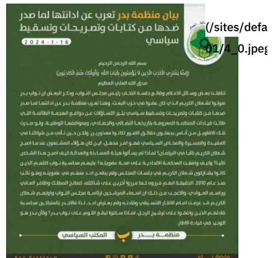
Figure 4: Badr's first statement, January 16, 2024.

These accusations faced backlash from other CF members, particularly the Hikma movement and the Badr Organization (/node/17003), the likely targets of Turki’s slurs. Badr’s political office issued two statements within minutes of the accusations. In the first one, Badr did not deny that its members voted for Karim but asked, “Where were these accusers when Shalan al-Karim became a member of parliament in 2010?...The strange point is that [his] name...was presented to the CF and its leaders, and no one expressed any opposition” (Figure 4).