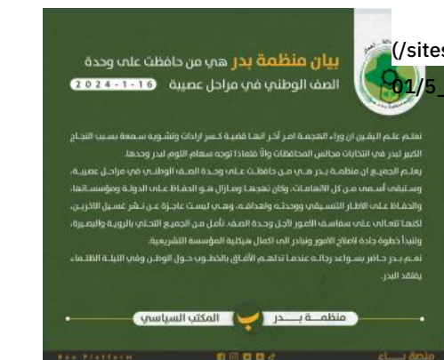
Figure 5: Badr's second statement, January 16, 2024.

The second statement was more strongly worded, accusing other militias of jealousy toward Badr’s purported success in Iraq’s recent provincial elections: “We know for certain that there is something else behind the attack [against Badr]. It is a case of breaking