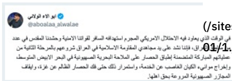
Figure 1: Abu Ala al-Walai announces the second phase of Iraqi muqawama operations, January 24, 2024.

On January 24, Abu Ala al-Walai (/node/18489) (real name Hashim Bunyan al-Siraji), the leader of the U.S.-designated militia Kataib Sayyid al-Shuhada (/node/16731) (KSS), posted a statement announcing the start of the second phase of Iraqi muqawama (resistance) operations in solidarity with the Hamas war. According to him, "[This phase] will include enforcing the blockade on Zionist maritime navigation in the Mediterranean Sea and render the [Israeli] entity's ports out of service...This will continue until the unjust siege on Gaza is lifted and the horrific Zionist massacres against its people are stopped" (Figure 1).