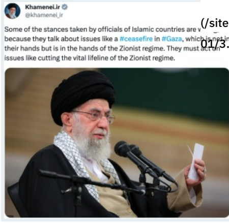
Figure 3: Khamenei calls for "cutting the vital lifeline" of Israel, January 23, 2024.

The latest developments unfolded immediately after Iranian Supreme Leader Ali Khamenei called for “cutting the vital lifeline of the Zionist regime” during a January 23 speech to “the organizers of the National Congress for the Commemoration of the 24,000 Martyrs from Tehran Province” (Figure 3). Khamenei made a similar call during a November 1 speech to Iranian students, asking “Muslim governments” to “block oil exports to the Zionist regime and stop economic cooperation with that regime (Figure 4).