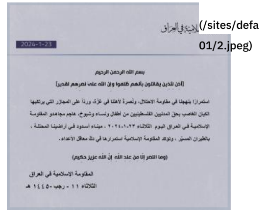
Figure 2: IRI claims responsibility for a drone attack against Ashdod port, January 23, 2024.

They might also try to goad the United States into conducting more strikes inside Iraq. The militia Kataib Hezbollah (/node/16641) has already been prodding Washington with new strikes against al-Asad Air Base in recent days, seemingly trying to up the stakes after U.S. forces did not respond immediately to a major January 20 ballistic missile salvo. Ironically, the group may be hoping for intensified U.S. strikes on muqawama leaders in central Baghdad, since that may be the only way of pushing the Iraqi government into formally requesting a change of status in the U.S. military presence. Yet Washington wants to control the terms of any withdrawal debate and may not give the militias a clear excuse to attempt new parliamentary action. ❖