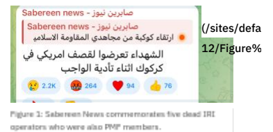
Figure 1: Sabereen News commemorates five dead IRI operators who were also PMF members.

On December 3, a U.S. airstrike in Kirkuk killed five members of the Iran-backed militia Harakat Hezbollah al-Nujaba (/node/16716) (HaN) as they were preparing to launch a one-way attack drone. Social media affiliated with HaN immediately mourned the dead fighters without mentioning that they were members of the Popular Mobilization Forces (PMF), the official militia umbrella organization paid for and avowedly commanded by the Iraqi government. The usual course of action for Iranian proxies in this kind of incident is to hide under the umbrella of legitimate Iraqi national forces, thereby creating confusion and avoiding potential consequences. This time was different, however.