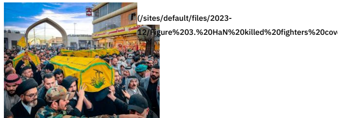
Figure 3: The HaN flag on the coffins of PMF members who were killed as they prepared a drone attack on U.S. forces.

On December 4, the five fighters were buried in Najaf after a funeral service in Baghdad. Their coffins were covered with HaN's flag, not the Iraqi or PMF flag. This was presumably done to separate them from the wider PMF umbrella and suggest that they were not part of any official Iraqi security agency (Figure 3). Similarly, al-Nujaba TV (/node/16912) claimed that the fighters were part of "the resistance" and avoided mentioning the PMF. For example, the channel declared, "With great presence, the resistance commences the funeral of the martyrs killed in the U.S. aggression incident in Kirkuk."