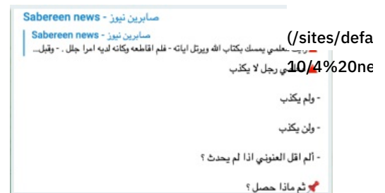
Figure 4: Sabereen News mentions its muwallami post, October 18, 2023.