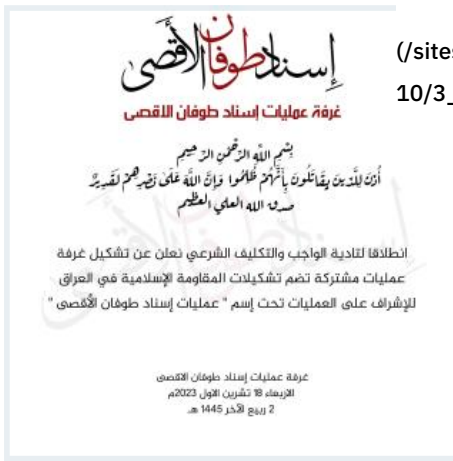
Figure 3: The Operations Support Room for al-Aqsa Flood announces its establishment, October 18, 2023.