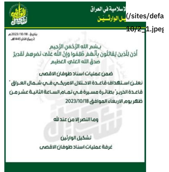
Figure 2: Tashkil al-Waritheen (/node/17621) claims responsibility for a drone attack on Harir Air Base, October 18, 2023.

In contrast to the al-Asad attack, muqawama platforms promptly reported and celebrated the Harir attack, which occurred in daytime hours when more members and supporters were likely paying attention. The initial claim of responsibility was made by Tashkil al-Waritheen (/node/17621) , a facade group that is affiliated with the militia Harakat Hezbollah al-Nujaba (/node/16716) and enjoys direct links with Iran's Islamic Revolutionary Guard Corps-Qods Force (IRGC-QF). Waritheen's claim read: "As part of the operations supporting al-Aqsa Flood [the code name for Hamas's October 7 assault on Israel], we announce that the American occupation base in northern Iraq was targeted by a drone at exactly twelve o'clock in the afternoon on Wednesday, 10/18/2023. The victory comes only from God. Tashkil al-Waritheen, Operations Support Room for al-Aqsa Flood" (Figure 2). Later, the Islamic Resistance in Iraq also claimed the attack, but seemingly in an overlapping rather than contradictory manner.