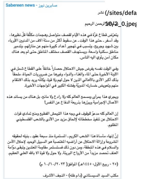
Figure 2: Sabereen reposts Sistani's statement, October 13, 2023.

Alternatively, the messages could point to non-kinetic or pre-kinetic types of involvement, such as helping consolidate Hezbollah's positions in south Lebanon or increasing the militia presence in the Syrian Golan and al-Quneitra in anticipation of the conflict widening to other areas. In fact, the muallemi saying is so well-known today that it could be used simply to lend seriousness to an effort that may not have much actual operational impact. Thus far, Iran's broader "axis of resistance" (including Lebanese Hezbollah) has operated in a supporting role to the Hamas war, drawing Israel's attention and reserves away from Gaza in an apparent attempt to deter a ground operation into the Strip. ❖