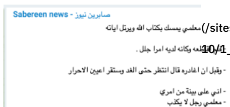
Figure 1: Sabereen's " mualllemi " post, October 13, 2023.

Following the outbreak of war between Israel and Hamas last week, Iraqi militia media outlet Sabereen News (/node/16673) has returned to its old style of used coded religious language to report important developments regarding the self-styled muqawama (resistance). One key message posted early on October 13 read as follows: "I saw mualllemi (my teacher/mentor) holding the book of Allah and reading its verses. I didn't interrupt him because he seemed like he had something great to present. Before I left, he said, 'Wait until tomorrow and the freemen eyes will be happy.' My teacher is a man who doesn't lie" (Figure 1). Historically, this coded language has been used to signal imminent muqawama action.