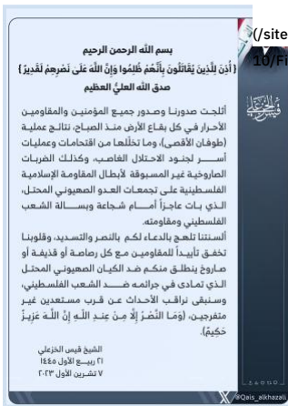
Figure 2: Qais al-Khazali welcomes the Hamas attack in understated fashion.

In an October 7 statement, Qais al-Khazali, the head of Asaib Ahl al-Haq (/node/16715) (AAH) and cofounder of the Coordination Framework, hailed the Hamas operation: "We and all Muslims and the free resisters were heartened by the result of operation tawafan al-Aqsa [Jerusalem Flood]...We are watching the events and are ready" (Figure 2). These understated comments may stem from a desire to appear less extreme than other muqawama politicians, in line with his longstanding but improbable (/node/1870) effort to be delisted as a terrorist and openly embraced by major Western embassies.