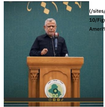
Figure 1: Hadi al-Ameri threatens "all U.S. targets" on October 10, 2023.

The most prominent muqawama statement was issued by Hadi al-Ameri, who heads the Badr Organization (/node/17003) and the Coordination Framework, the Shia leadership coalition that oversees militia political parties. During a rally for the muqawama 's Nabni coalition ahead of last week's provincial election, Ameri declared, "Our stand is clear. If the Americans intervene in the battle with Hamas, we will attack all U.S. targets. Therefore, they need to stop the support for this Zionist entity" (Figure 1). The angry remarks appeared to break his longstanding habit of not explicitly calling for the killing of Americans.