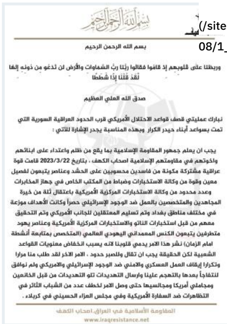
Figure 1: AK's strongly worded statement (page 1), August 13, 2023.

presence may have been specifically targeted by the Saddami government and its Communications and Media Commission (/node/17986) under the cover of a recent blanket Telegram ban (/node/18260) ,