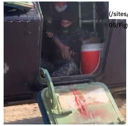
Figure 1: Federal Police injured by Kataib Hezbollah fighters in Albu Aitha, May 15, 2023.