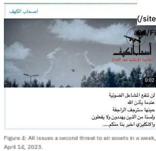
Figure 4: AK issues a second threat to air assets in a week, April 16, 2023.

The "English" comment was likely a reference to the May 6, 2006, fatal shutdown of a British Lynx helicopter over Basra, which killed five personnel. The crash was caused by