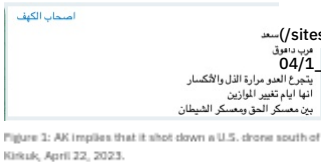
Figure 1: AK implies that it shot down a U.S. drone south of Kirkuk, April 22, 2023.

On April 22, Combined Joint Task Force-Operation Inherent Resolve issued a short statement (https://www.inherentresolve.mil/NEWSROOM/News-Articles/Stories-Display/Article/3371367/coalition-unmanned-aerial-vehicle-crashes-outside-kirkuk/) noting the following: "On the morning of April 22, 2023, a Coalition Unmanned Aerial Vehicle (UAV), in direct support of Iraqi Security Forces (ISF) operations, experienced a mechanical failure and crashed south of Kirkuk, Iraq...Coalition service members cleared the area with a controlled detonation."