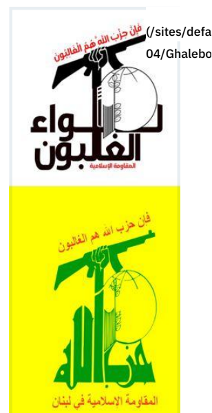
Liwa al-Ghaliboun logo (top) compared to Lebanese Hezbollah logo (below). Both use an identical gun graphic and the same quote from the Quran. Liwa al-Ghaliboun is the only muqawama group