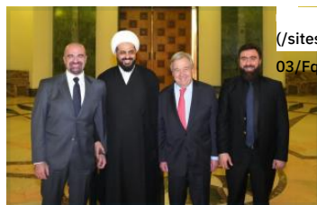
Figure 2: Designated human rights abuser Rayan al-Kildani (far right) next to UN secretary-general Antonio Guterres on March 2, 2023. Second from left is designated terrorist and human rights abuser Qais al-Khazali.

Despite the Christian facade provided by the Kildani family and some unit commanders, KB is not the Christian brigade it portrays itself to be. It is manned almost exclusively by non-Christians, mostly Shia Muslims from southern Iraq. Using financial support from Iran and an election campaign centered on vote-buying, KB's political branch, the Babylon Movement, was able to double its national parliamentary representation in the 2021 polls and now controls four of the five seats reserved for Christians.