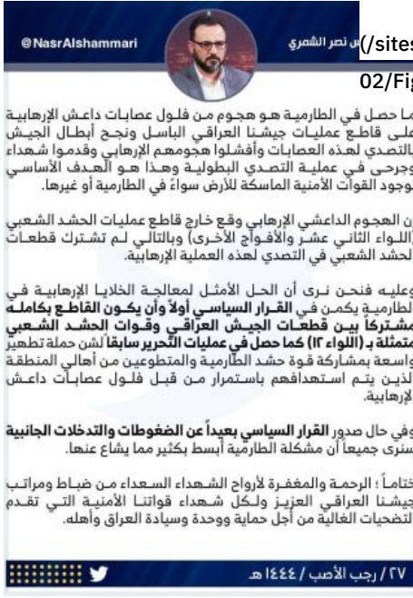
Figure 2: Nasr al-Shammari calls for PMF control of Tarmiyah, February 18, 2023.

Hezbollah al-Nujaba (/node/16716) (HaN): "We believe that the best solution to deal with the terrorist cells in Tarmiyah lies in the political decision first, and that the sector is to be fully shared between Iraqi army units and the [PMF] represented by the 12th Brigade, as happened in the previous liberation operations to launch a wide cleansing campaign with the participation of the Tarmiyah Mobilization Force and volunteers from the people of the area who are constantly being targeted by the remnants of IS terrorist gangs" (Figure 2). Notably, the 12th Brigade is HaN's PMF unit.