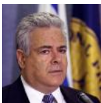
Ephraim Sneh (/experts/ephraim-sneh)