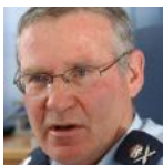
Amos Yadlin (/experts/amos-yadlin)