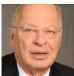
Ehud Yaari (/experts/ehud-yaari)

Brig. Gen. Ephraim Sneh, IDF (Res.), is a former minister of health, minister of transportation, and deputy minister of defense. He commanded Israeli forces in south Lebanon and headed the civil administration in the West Bank