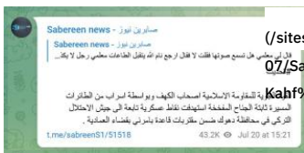
Figure 2: Sabereen News attribution of attack to Ashab al-Kahf, July 20, 22:31 hours

Sabereen News (/node/16673) (Interestingly, the July 22 follow-up drone strike seems to have been fully intercepted by Turkish counter-drone systems at Bamerni, despite Sabereen's claim that "Murad-5" type fixed-wing drones were used in the attack. It will be interesting to see how the muqawama treat this tactical/technical failure.)