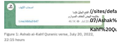
Figure 1: Ashab al-Kahf Quranic verse, July 20, 2022, 22:15 hours