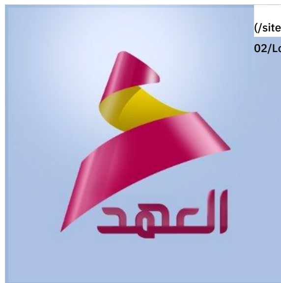
Al-Ahd TV Logo