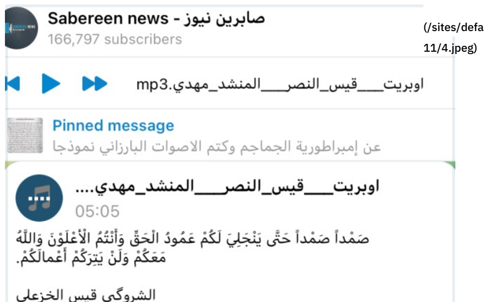
Figure 2: Sabereen News reposts Imam Ali's sentence, November 12, 2021

Such messaging indicates that AAH and KH have decided to escalate if their political parties are marginalized in the government formation process. The November 7 drone attack (/node/17121) on the prime minister's residence was apparently aimed at getting militias back to the negotiating table, and the incident did in fact secure them at least one meeting with Iraq's highest authorities. Yet if those discussions do not win them shares in the next government, they seem willing to go