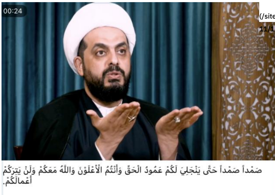
Figure 1: Post from accounts close to Qais al-Khazali about the possibility of his killing , November 12, 2021

that my death satisfies America and Israel. But I want the young men to not allow this satisfaction to last and turn it to hell for them and not allow them to be present in Iraq.” A written message included under the footage was telling: “[Remain] steadfast until the pillar of truth appears to you and you are supreme, and God is with you and will not leave you” (Figure 1). This phrase is attributed to a story in which the Imam Ali encouraged his men to move forward on the battlefield.