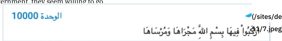
Figure 3: Unit 10,000 posts a Quranic verse about Noah, November 12, 2021

Iran’s apparent directives to de-escalate the crisis. Their brewing schism with Tehran began before Qaani visited Baghdad last week. After recent clashes in front of the International Zone, Sabereen News harshly criticized Iran for not publicizing the clashes sufficiently, issuing an angry Farsi message that read: “Iran’s state media outlets, you should be ashamed! We gave blood today, a shoe of a martyr is more valuable than Kadhimi...This was not