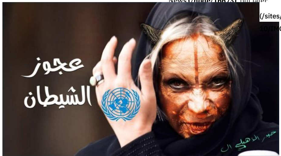
Figure 2: Graphic posted on a few muqawama social media channels calling the head of UNAMI "Ajouz al-Shaitan," October 17, 2021.

Some of these posts have carried threats of violence as well. On October 13, a muqawama graphic designer known as "Ayraaq" posted a picture of Hennis-Plasschaert in his Telegram account depicting flames and a tank coming out of her face. The depiction was captioned in English: "You ll [sic] get treatment like US convoys" (Figure 3). This is a reference to the longstanding muqawama campaign of attacking U.S. logistical convoys (/node/16614) with explosives. The picture was reposted by Sabereen News (/node/16673) but later