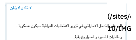
Figure 5: La Makan, La Watan threatens the UAE, October 17, 2021.

Similar threats were made by muqawama social media outlets. On October 17, the channel La Makan, La Watan ([I Have] No Place, No Homeland) posted the following: “The leader said: The response to the UAE's interference in rigging the Iraqi election will be a military one, [using] drones and missiles and the rest of it” (Figure 5).